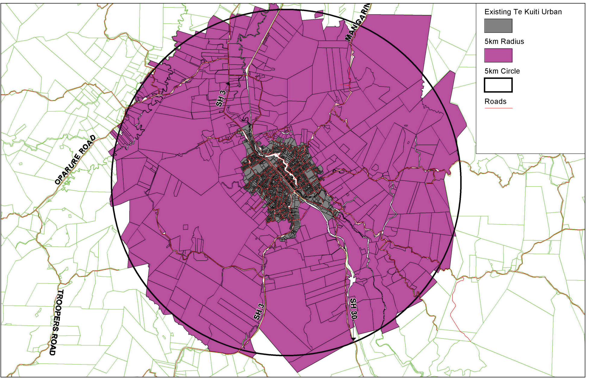
Digital map data supplied by Critchlow Associates Ltd. Sourced from Land Information New Zealand. CROWN COPYRIGHT RESERVED. Imagery from Terralink International Limited. The information displayed in the GIS has been taken from Waitomo District Council's databases and maps. It is made available in good faith but its accuracy or completeness is not guaranteed. If the information is relied on in support of a resource consent it should be verified independently.